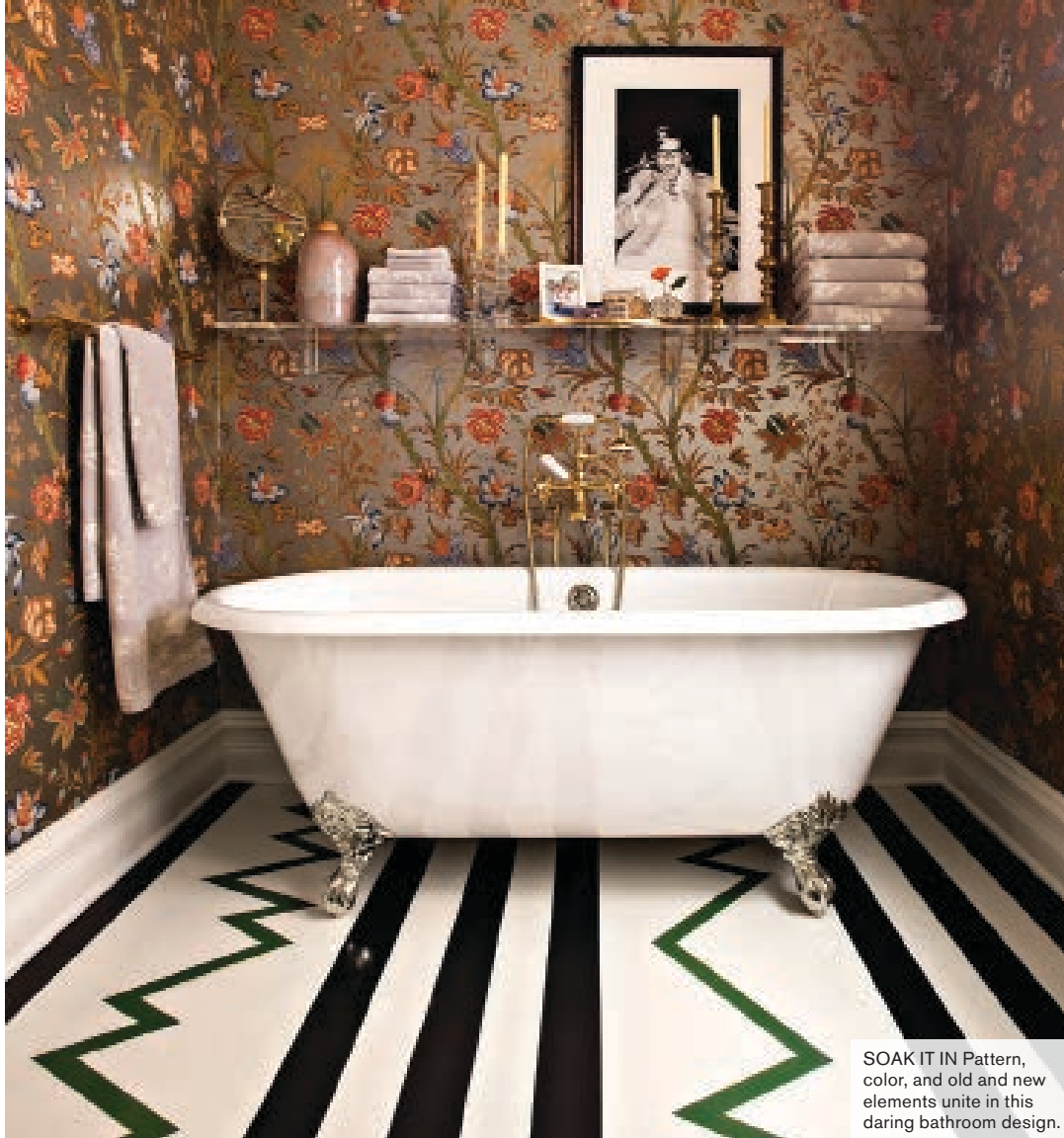
SOAK IT IN Pattern, color, and old and new elements unite in this daring bathroom design.